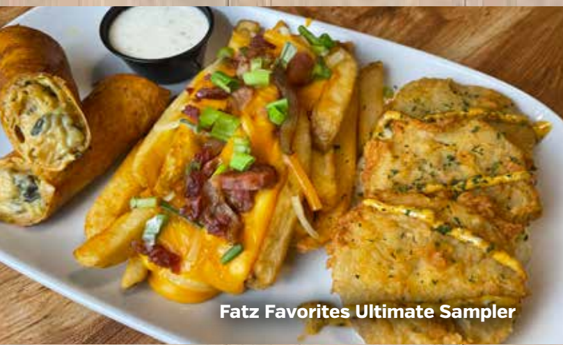
Fatz Favorites Ultimate Sampler