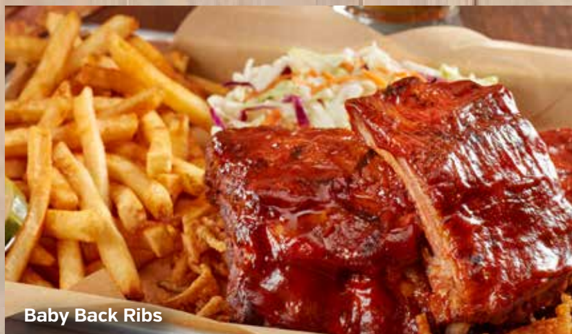
Baby Back Ribs

Tender, delicious Brookwood BBQ teamed up with our World Famous Calabash Chicken. Served with fries. 19.49