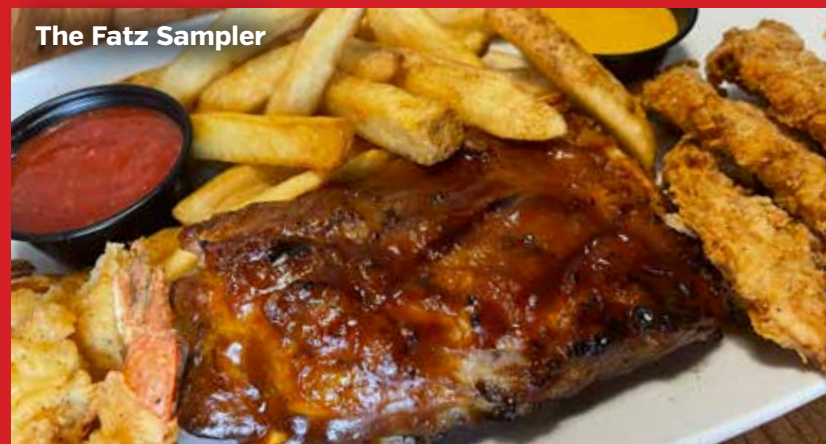
The Fatz Sampler

One pound of our tender baby back ribs sauced in tangy, flavorful Carolina Gold BBQ sauce, and teamed up with our mouth-watering Calabash chicken tenders. Served with a side of fries or tots. 19.99