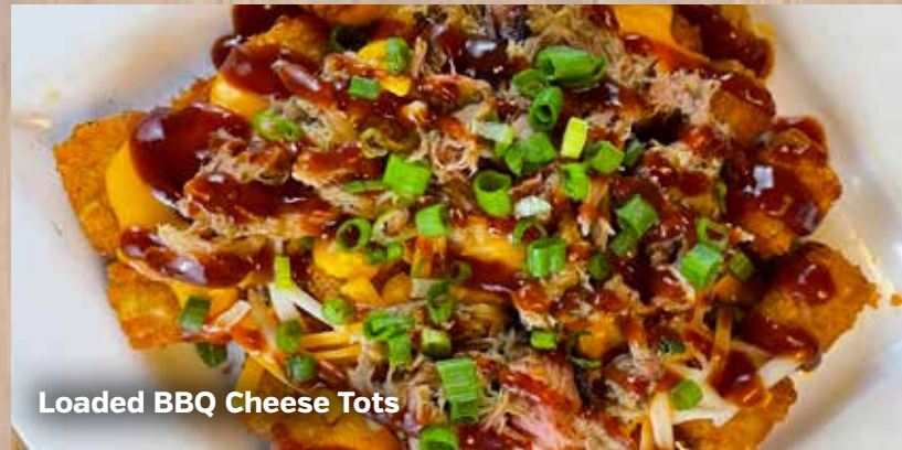
Loaded BBQ Cheese Tots