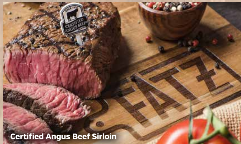
Certified Angus Beef Sirloin

A comfort food classic served with red-skinned mashed potatoes and green beans. 13.99